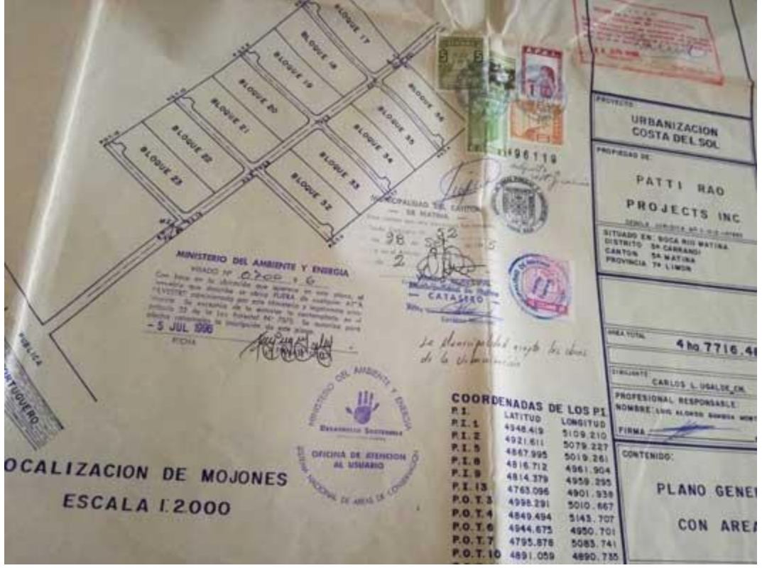
Project plans approved by the Municipality of Matina and sealed by the Minae.