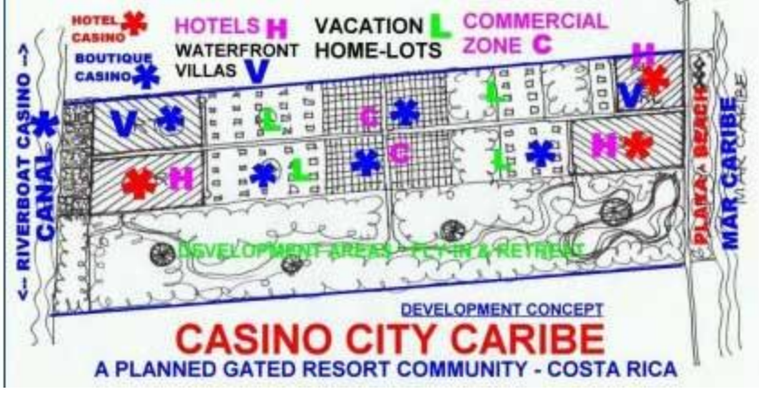
Master plan of the project presented by Patti Rao Projects.

The complex will also have a heliport, a marina and access to the beach.